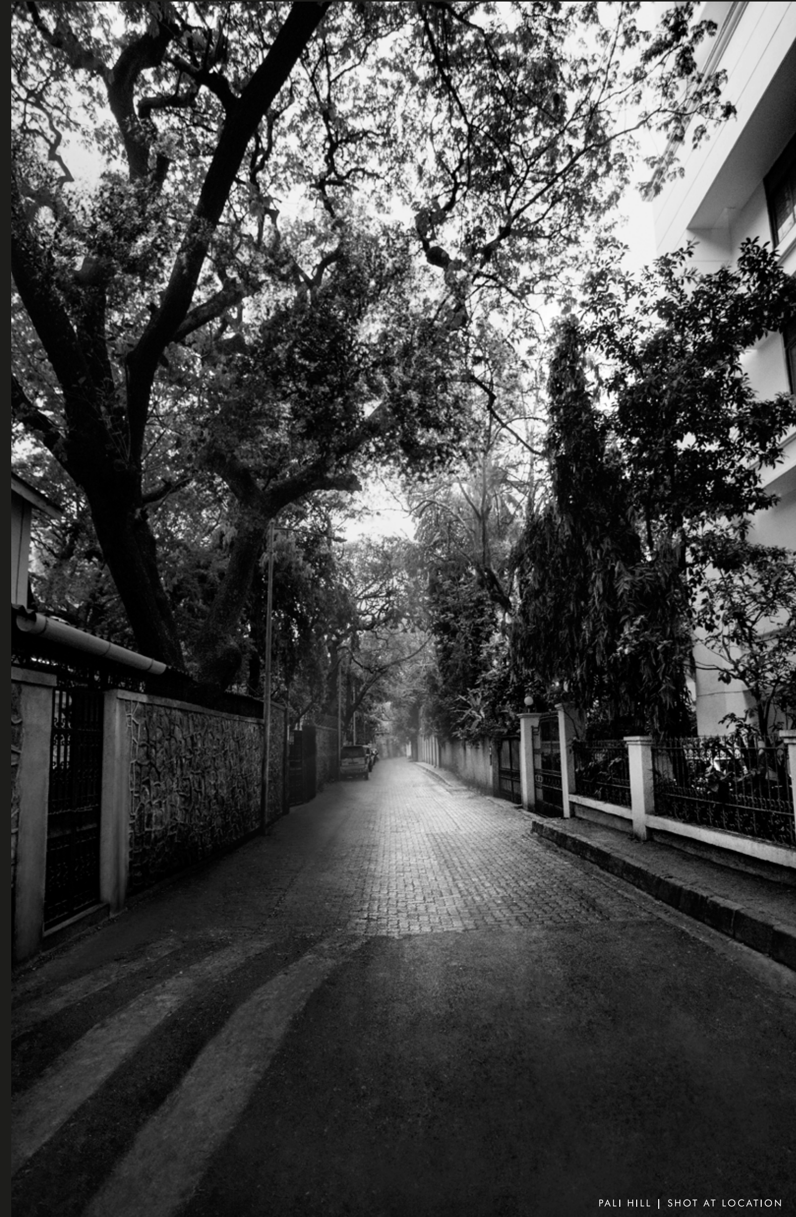
PALI HILL | SHOT AT LOCATION