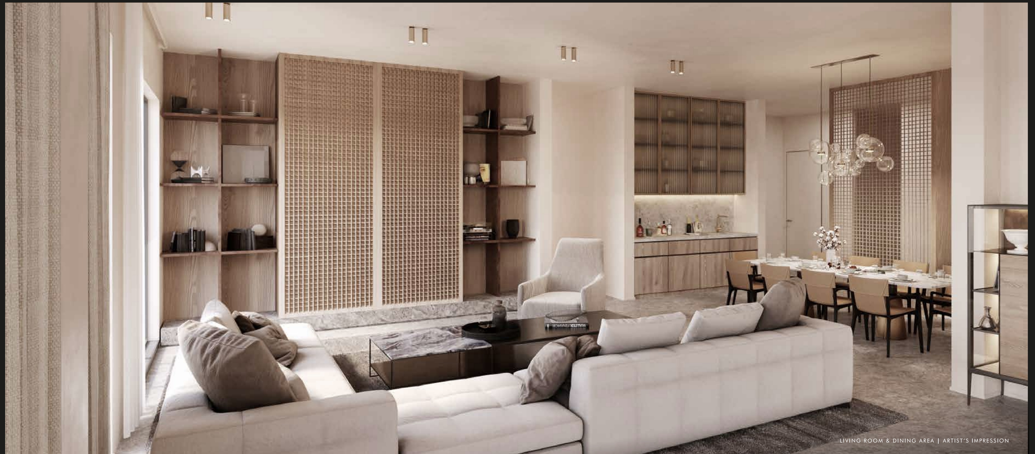
LIVING ROOM & DINING AREA | ARTIST'S IMPRESSION

Discover the city's most coveted indulgence: space. Spacious 3, 4 and 5 bedroom residences designed to redefine your interpretation of luxury. These residences are the platinum standard in opulence. They are proof that art doesn't exclusively belong in museums. And that the reward for having it all should be coming home.