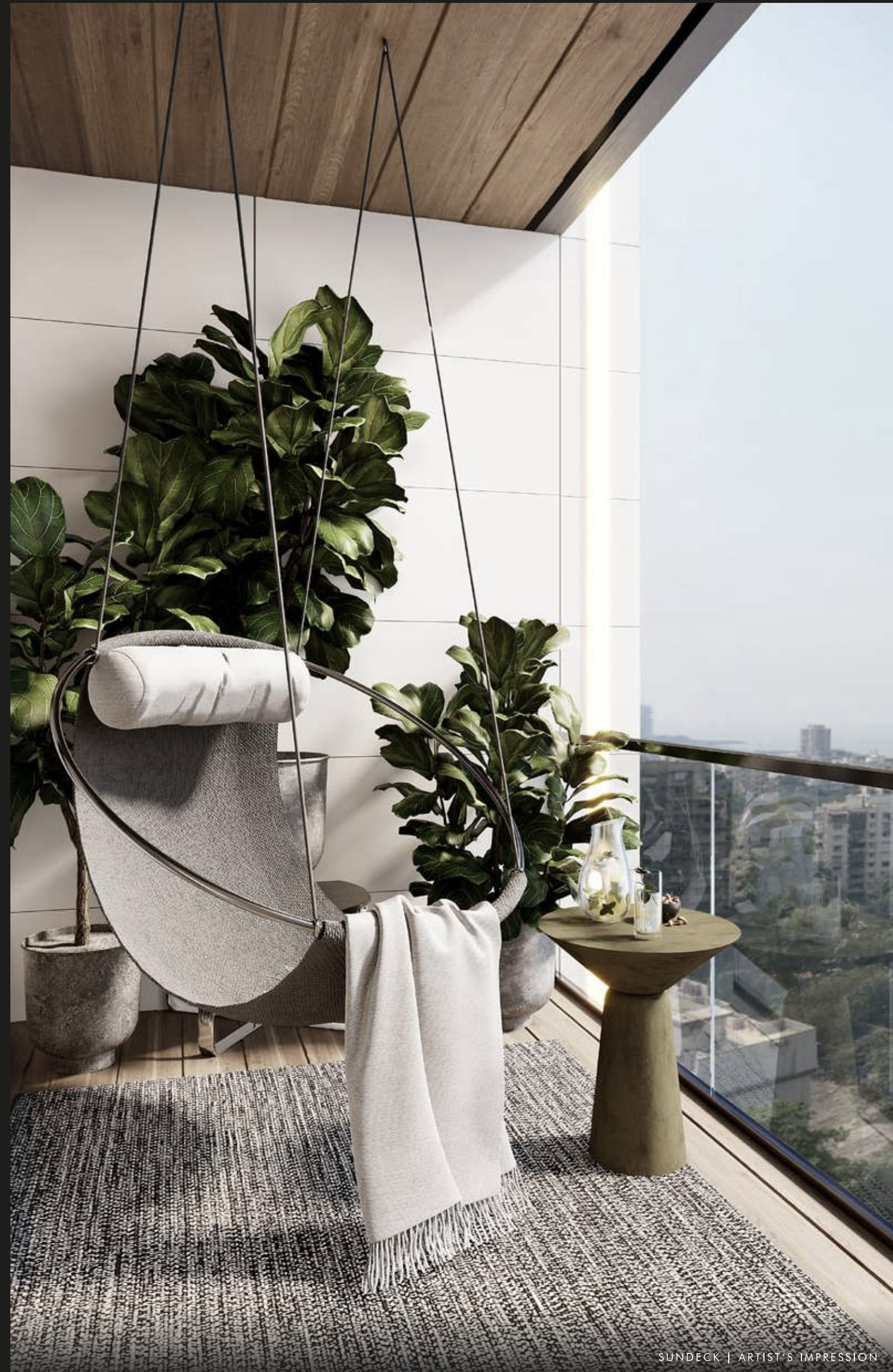
SUNDECK | ARTIST'S IMPRESSION